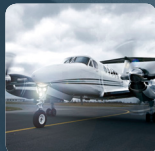
Satcom for aircraft of any size

The most important thing we build is trust