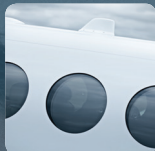
Low profile, low gain antenna