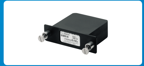
SwiftBroadband Unit (SBU)