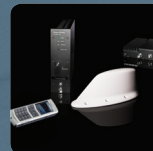
Simultaneous SwiftBroadband voice and data services